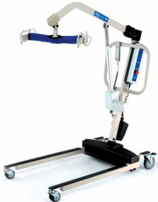
RPL600-2: Powered with power opening low base